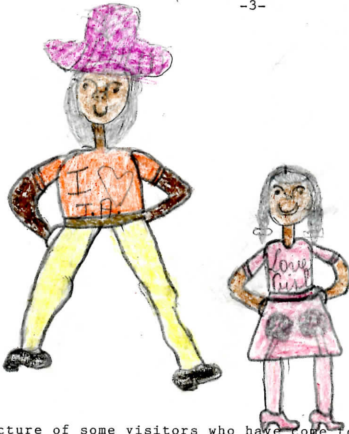
Draw a picture of some visitors who have come to Jamaica from far away.

If you would like to explain your drawing, use this space.